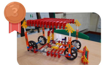
Birchwood Primary School, Suffolk

All of our winners will each receive a K'Nex Kit and certificate to take home and a trophy for the school cabinet.