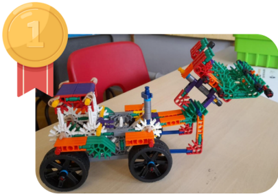
Stapleford Primary School, Hertfordshire

The judges spent many hours discussing each of the winning class models and deciding on the overall regional winners (from Herts/Luton and Essex/Suffolk/Peterborough areas). We are pleased to announce the winners: