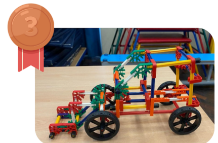
Whitehill Junior School, Hertfordshire