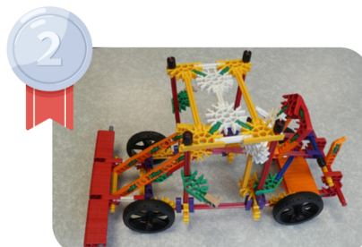
Stonham Aspal Primary School, Suffolk