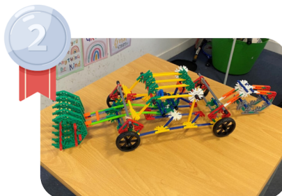
High Beeches Primary School, Hertfordshire